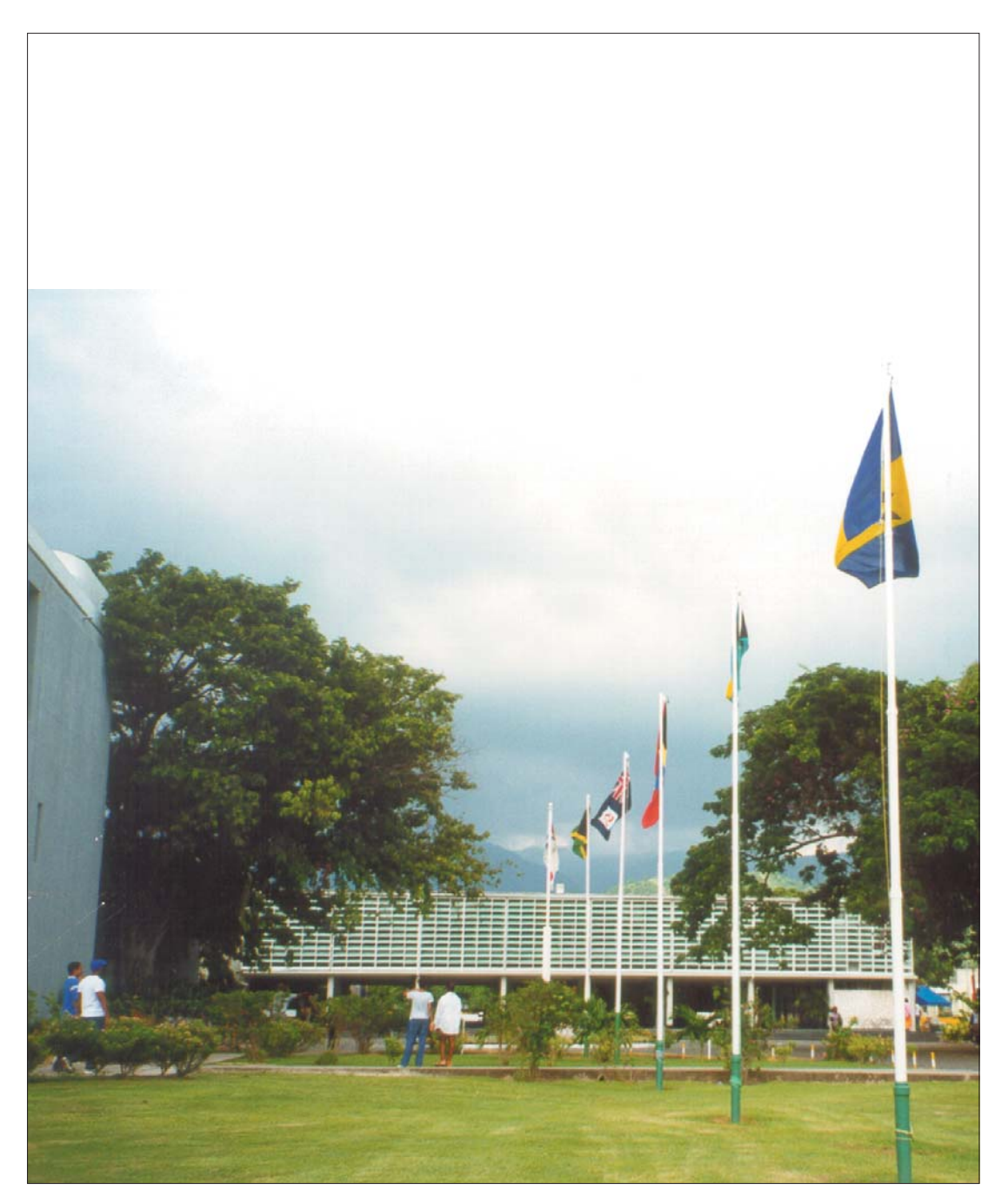
The University of the West Indies - Mona Campus Procurement Policies and Procedures Manual